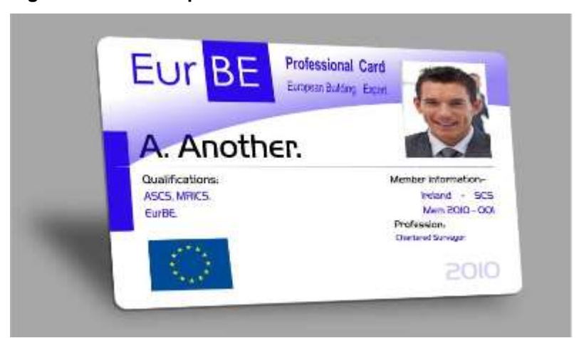
Example of a EUR BE Professional Card Figure 6.3:

Source: AEEBC website Available Online at http://www.aeebc.org/uk/professional%20development.asp Last Accessed 09 March 2011