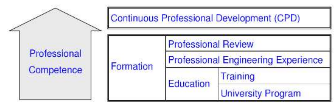
Figure 6.1: The FEANI Accreditation System

6.2.7 Their system also makes use of formulae to describe the different routes to reaching the required level of 'formation'. For example, the formula for the standard route to formation is: