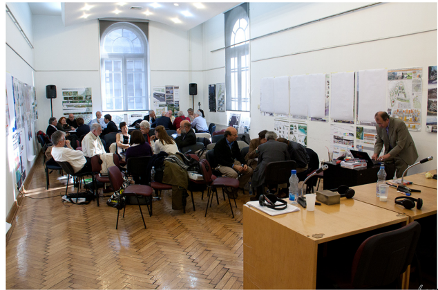
ECTP-CEU Workgroups at the General Assembly - Belgrade, May 7

Our next General Assembly will take place in Paris at the Palais de Iena, build by Auguste Perret, near Trocadero on November 4 and 5, 2011.